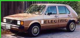
Electro Automotive VoltsRabbit

"Promoting the use of electric vehicles since 1967"