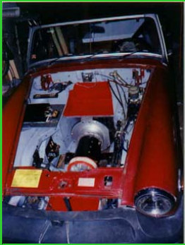
Acterra EV Conversion Project